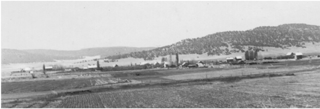
The small town of Ramah NM